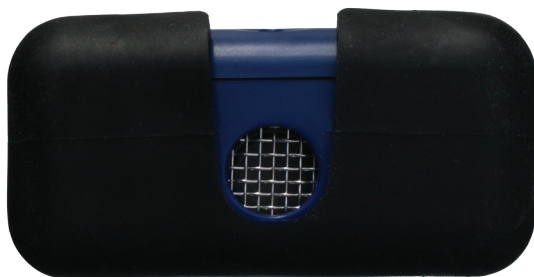
Ruggedized boot and Stand Included